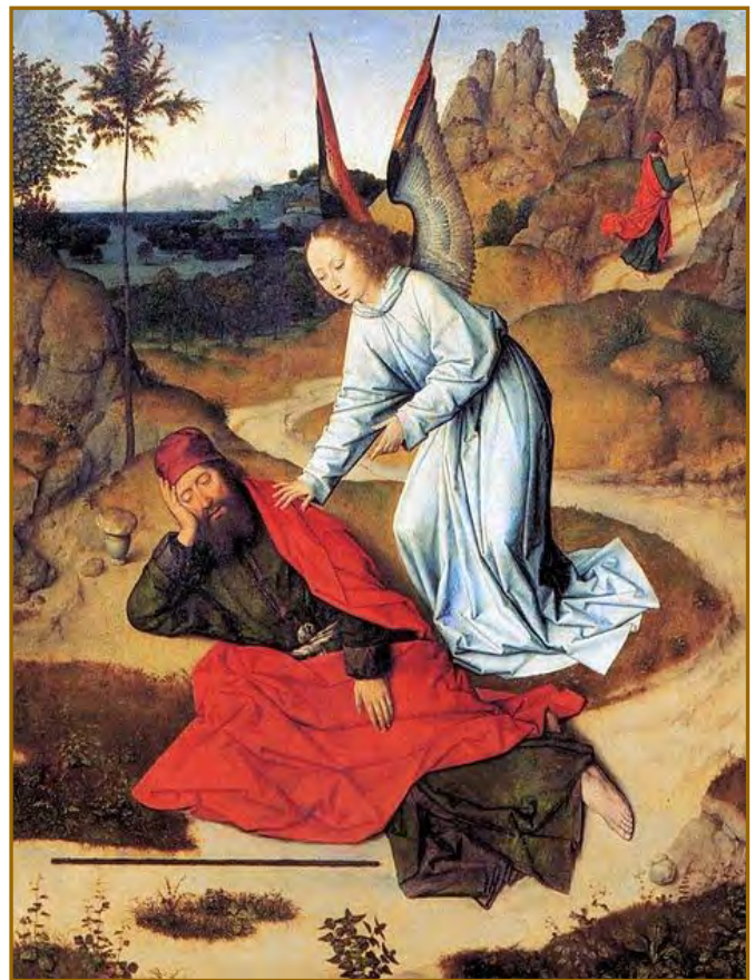
Prophet Elijah in the Desert Dieric Bouts, 1464-1468