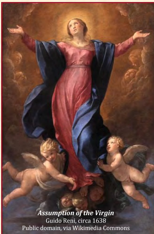
Assumption of the Virgin