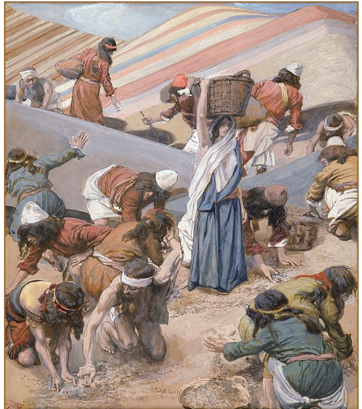
The Gathering of the Manna

Lectionary Bulletin Inserts: Reflections on the First and Second Readings, Year B © 2019 Archdiocese of Chicago: Liturgy Training Publications. All rights reserved. Written by Paul Turner. Lectionary for Mass © 2001, CCD.