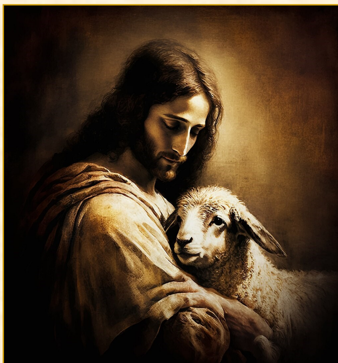
Gentle Jesus, Compassionate and Caring Good Shepherd Rosary Team.

Tuesdays through Thursdays: 9am-12pm; 12:30-3pm