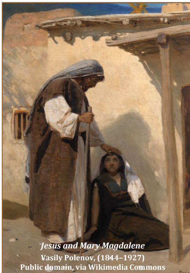
Jesus and Mary Magdalene