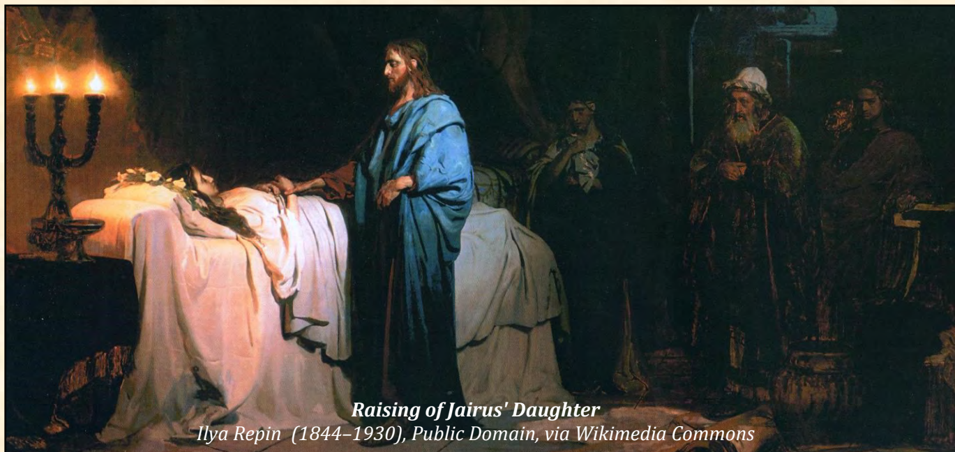
Raising of Jairus' Daughter

Thirteenth Sunday in Ordinary Time: June 30, 2024