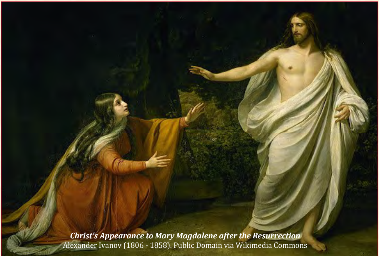
Christ's Appearance to Mary Magdalene after the Resurrection Alexander Ivanov (1806 - 1858).