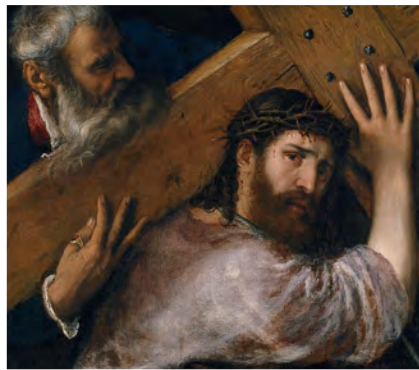
Carrying of the Cross," by Titian, 1565.