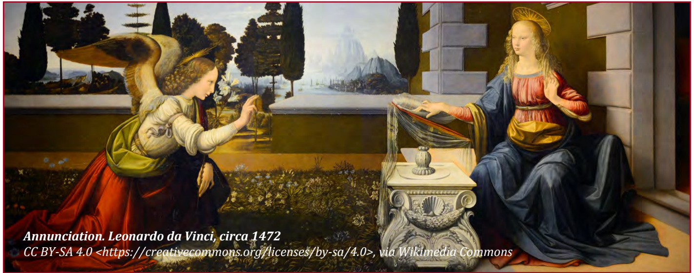
Annunciation. Leonardo da Vinci, circa 1472