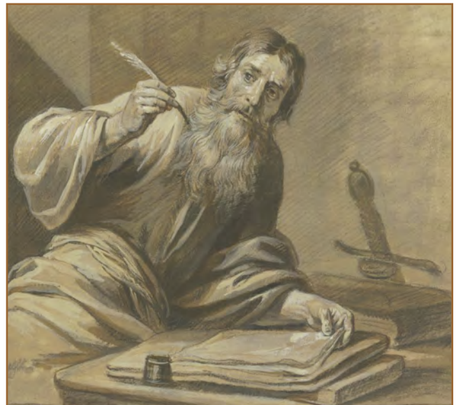
Der Apostel Paulus schreibend, halbe Figur (St. Paul writing his epistles) Jan Luyken (1649–1712), PDM-owner, public domain via Wikimedia Commons

Lectionary Bulletin Inserts: Reflections on the First and Second Readings, Year C © 2019 Archdiocese of Chicago: Liturgy Training Publications. All rights reserved. Written by Paul Turner. Lectionary for Mass © 2001, CCD