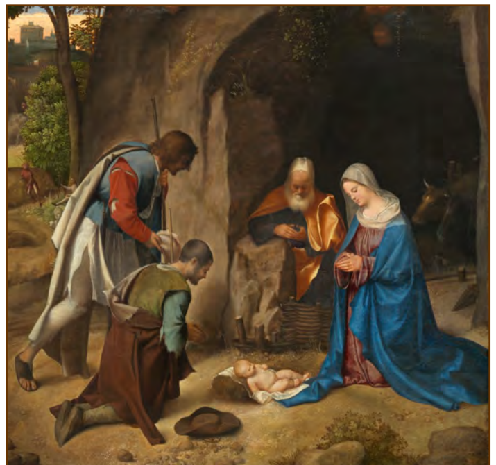
Adoration of the Shepherds

Lectionary Bulletin Inserts: Reflections on the First and Second Readings, Year C © 2019 Archdiocese of Chicago: Liturgy Training Publications. All rights reserved. Written by Paul