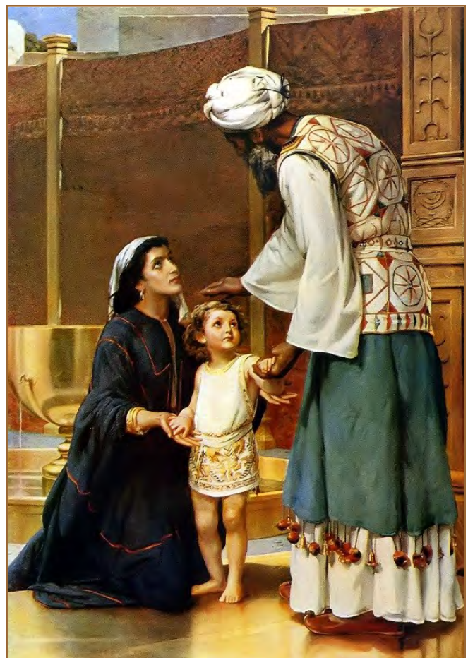
Samuel Dedicated by Hannah at the Temple Frank William Warwick Topham, (1838–1924)