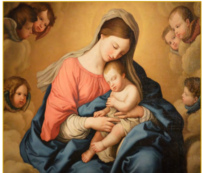
Madonna with Child and Angels Giovanni Battista Salvi da Sassoferrato. 1674.

© 2024 Liturgy Training Publications. 800-933-1800. Text by Krista Chinchilla-Patzke. Scripture quotations are from the New American Bible, revised edition. Permission to publish granted by the Archdiocese of Chicago.