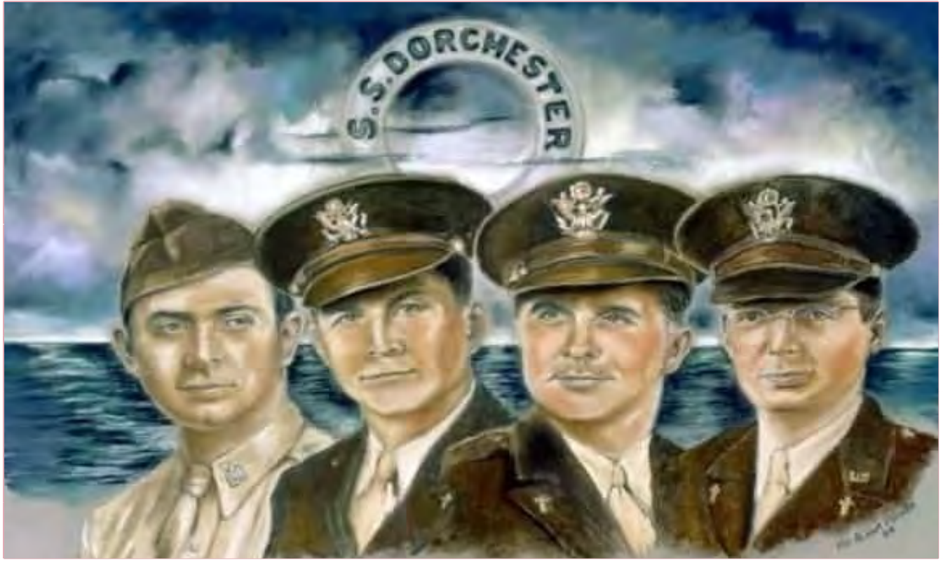
Lt. Alexander D. Goode, George L. Fox, Lt. Clark V. Poling, Lt. John P. Washington

Four Chaplains Day is celebrated every February in recognition of four army chaplains for their humanitarianism and heroism.