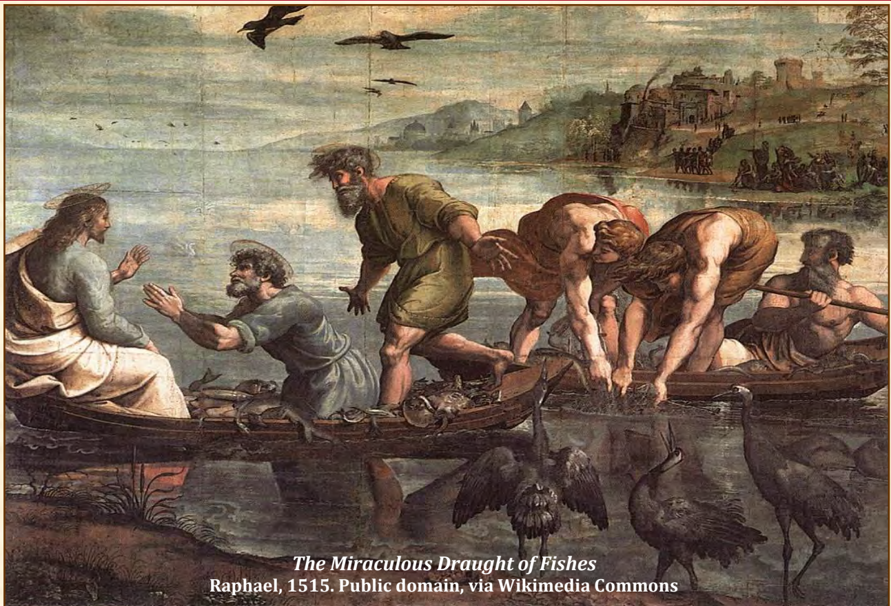
The Miraculous Draught of Fishes

Fifth Sunday in Ordinary Time: February 9, 2025