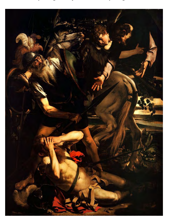
The Conversion of Saint Paul Caravaggio, (1600-01). Public domain, via Wikimedia Commons

© 2024 Liturgy Training Publications. Text by Krista Chinchilla-Patzke. Permission to publish granted by the Archdiocese of Chicago.