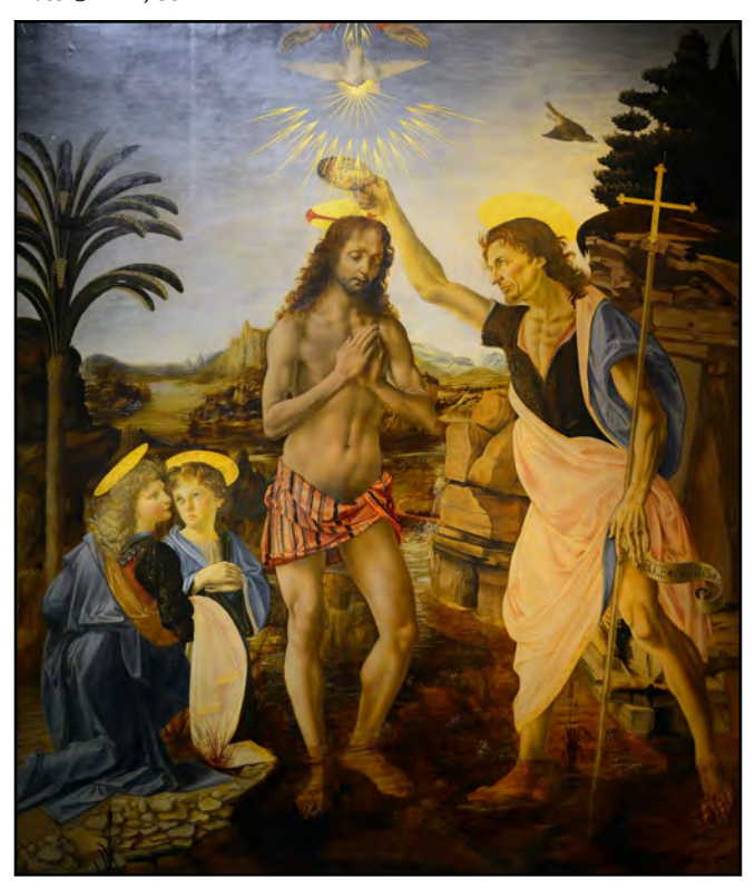
The Baptism of Christ Andrea del Verrocchio / Leonardo da Vinci 1470-75.

Lectionary Bulletin Inserts: Reflections on the First and Second Readings, Year C © 2019 Archdiocese of Chicago: Liturgy Training Publications. All rights reserved. Written by Paul Turner. Lectionary for Mass © 2001, CCD.