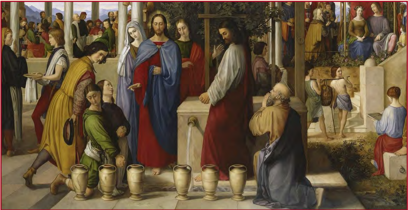
The Wedding Feast at Cana

Second Sunday in Ordinary Time: January 19, 2025