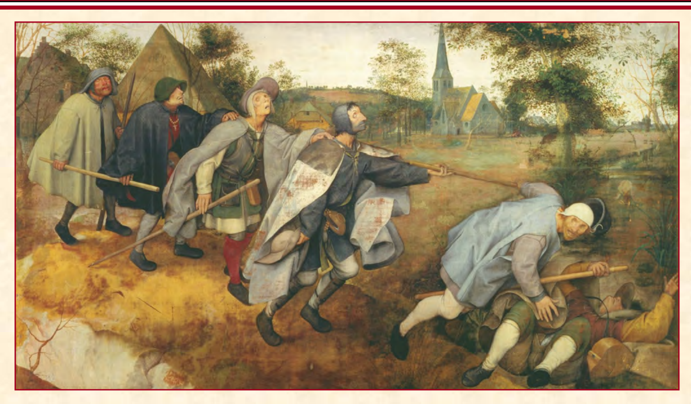
"The Blind Leading the Blind" by Pieter Bruegel the Elder (1568), Public domain, via Wikimedia Commons