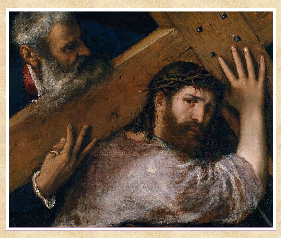
"Carrying of the Cross," by Titian, 1565.