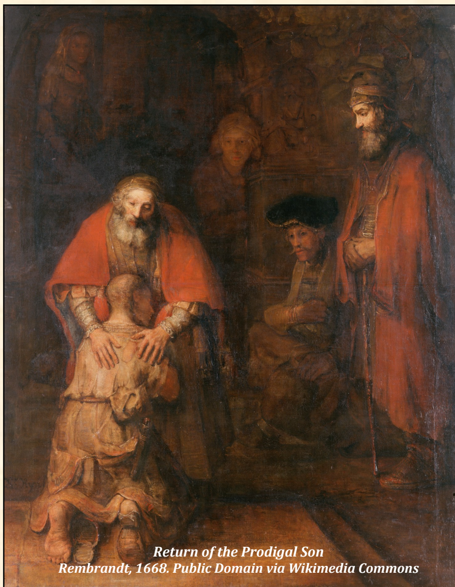
Return of the Prodigal Son Rembrandt, 1668.

145 Glen Avenue Sea Cliff, NY 11579 516-676-0676 www.saintboniface.org ; stbonchurch@gmail.com www.facebook.com/ StBonifaceMartyr/