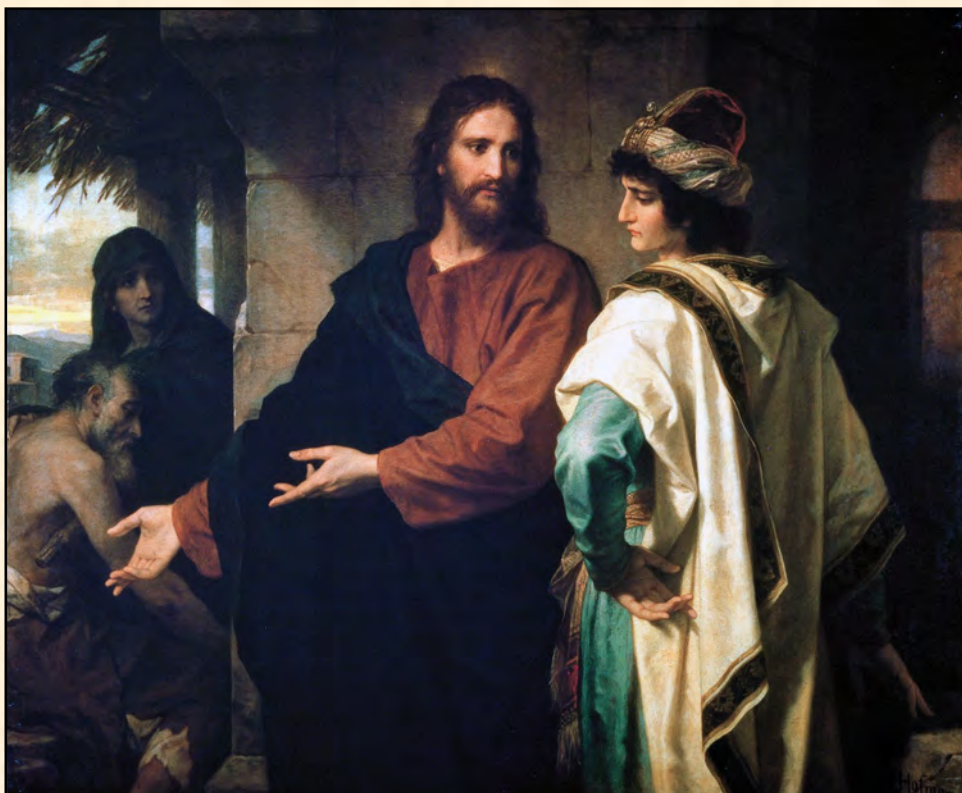
Christ and the Rich Young Ruler

Tuesdays through Thursdays: 9am-12pm; 12:30-3pm