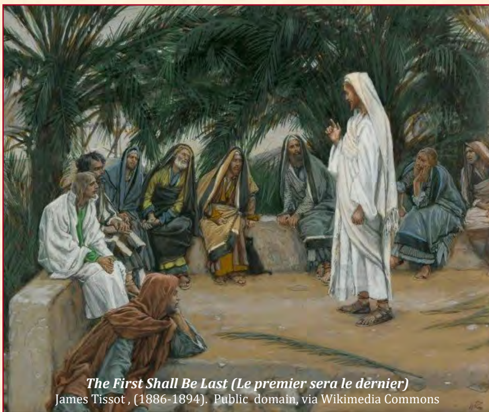
The First Shall Be Last (Le premier sera le dernier)

145 Glen Avenue Sea Cliff, NY 11579 516-676-0676 www.saintboniface.org stbonchurch@gmail.com www.facebook.com/ StBonifaceMartyr/